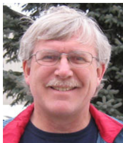
Thank you for your support.

I want to continue supporting reduction of poverty in Christ name through these agencies and people working in them, encouraging others to donate, serve and pray. Biking across the continent was a teenage hope. Now it can be reality with further purpose; enhanced by doing it with two sons, other Christian riders and numerous supporters. The tour celebrates living in God's creation and working to redeem it for His