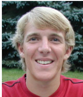
Thank you for your support.

I want to ride to see God's work. To ride would be to get into something beyond what I think is possible. I would love to live God's imagination. I ride to bring help to those in poverty. I believe that this trip would make God smile to see His people coming together to love Him and love each other. For fun too!